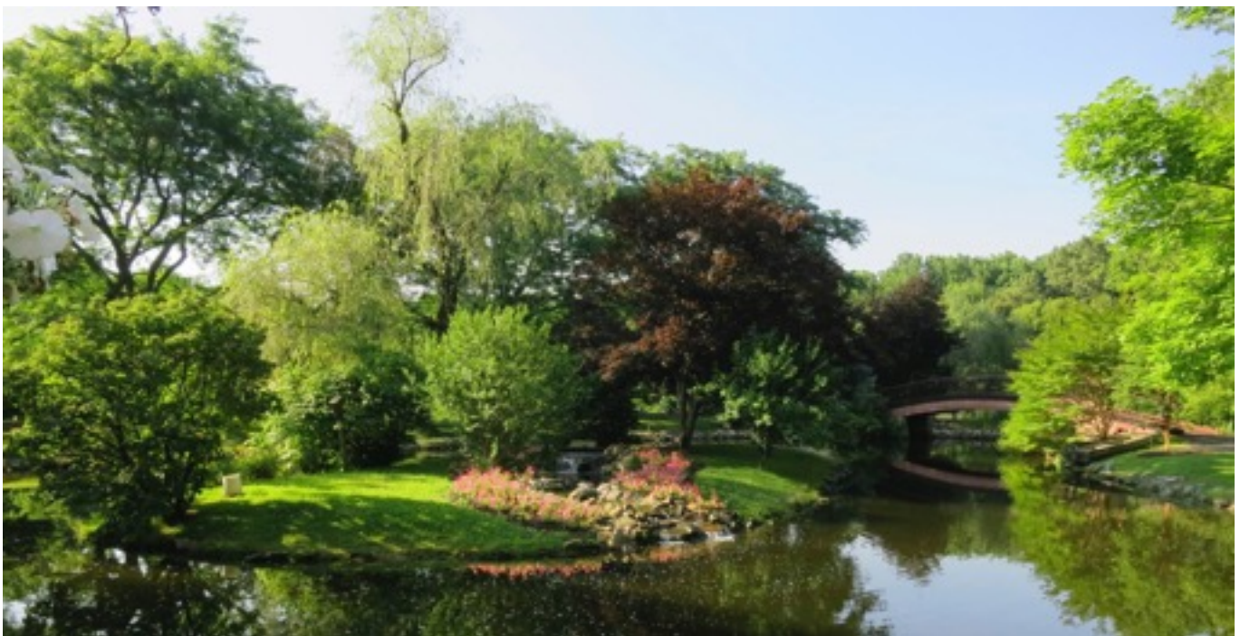
View of the beautiful park that surrounds the Bon Secours Conference Center located on 300 acres of land. See www.RCCBonSecours.com

The area is also served by Dulles (IAD) or to Reagan Nat'l (DCA). Let us know your flight information and we will make an effort to coordinate ground transportation.